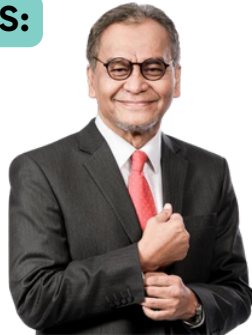
YB Datuk Seri Dr Dzulkefly Ahmad Minister of Health